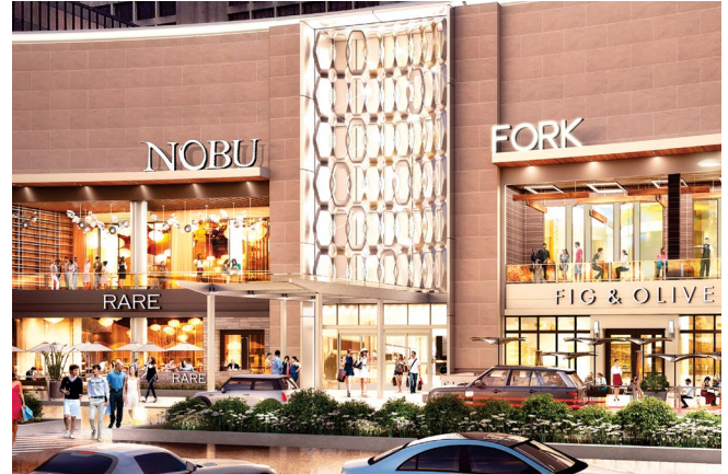
PRE-FINISHED GOLD + SILVER METALLIC FRP LINKED SCREEN

Formglas Products Ltd. 181 Regina Road Vaughan, Ontario, Canada L4L 8M3 T: 1.866.635.8030 F: 416.635.6588 Web: formglas.com Email: info@formglas.com