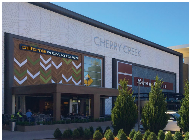
FACADE WITH ABSTRACT CRISS CROSS PATTERN CHERRY CREEK SHOPPING CENTER, DENVER