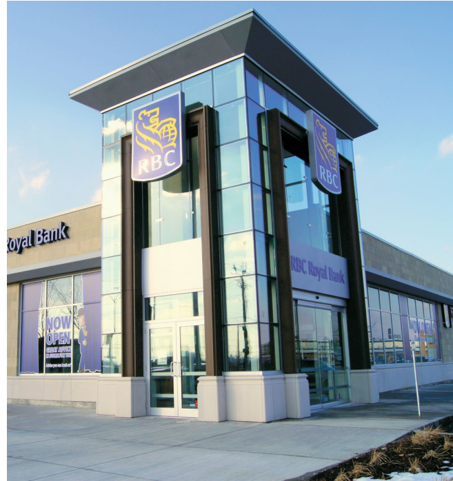
CORNICES & PORTAL ENTRY

To view photos of Formglas ® FRP applications, or to contact a local Formglas ® representative, visit www.formglas.com .